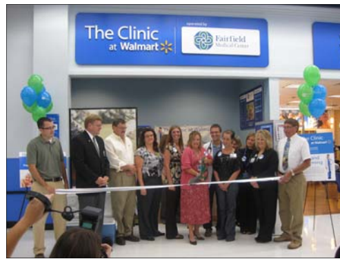
Ribbon Cutting for The Clinic at Walmart