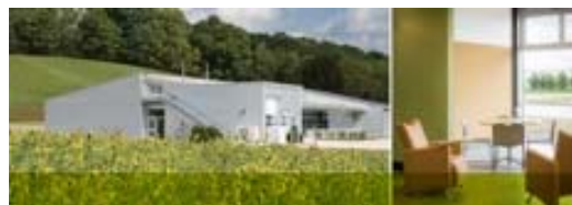
Hocking College Energy Institute