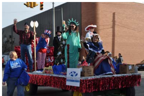
1st Place Float—Hocking Valley Community Hospital